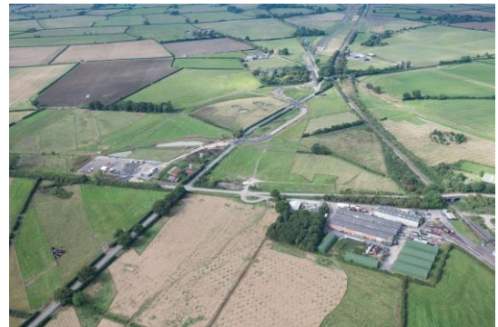
Station Road Compound and Site Access Road, September 2022.