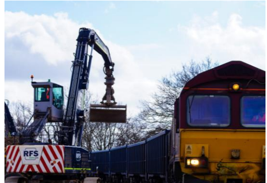
The above image is of our site in Calvert, taking HGV's off the local road network and moving material by rail, 2021.